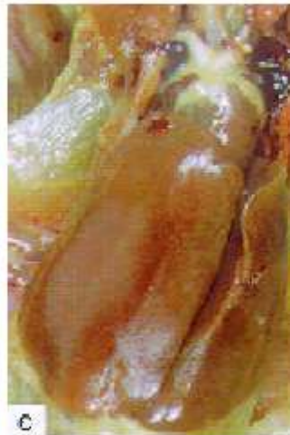
Myeloblastosis Enlarged grey red liver