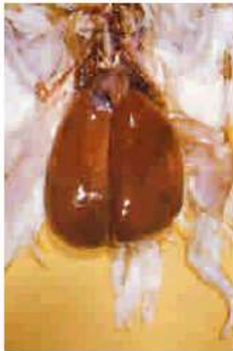
Erythroblastosis Enlarged cherry red liver

Liver: Severe diffuse tumoral infiltration with important Hepatomegaly (+ Leukemia)