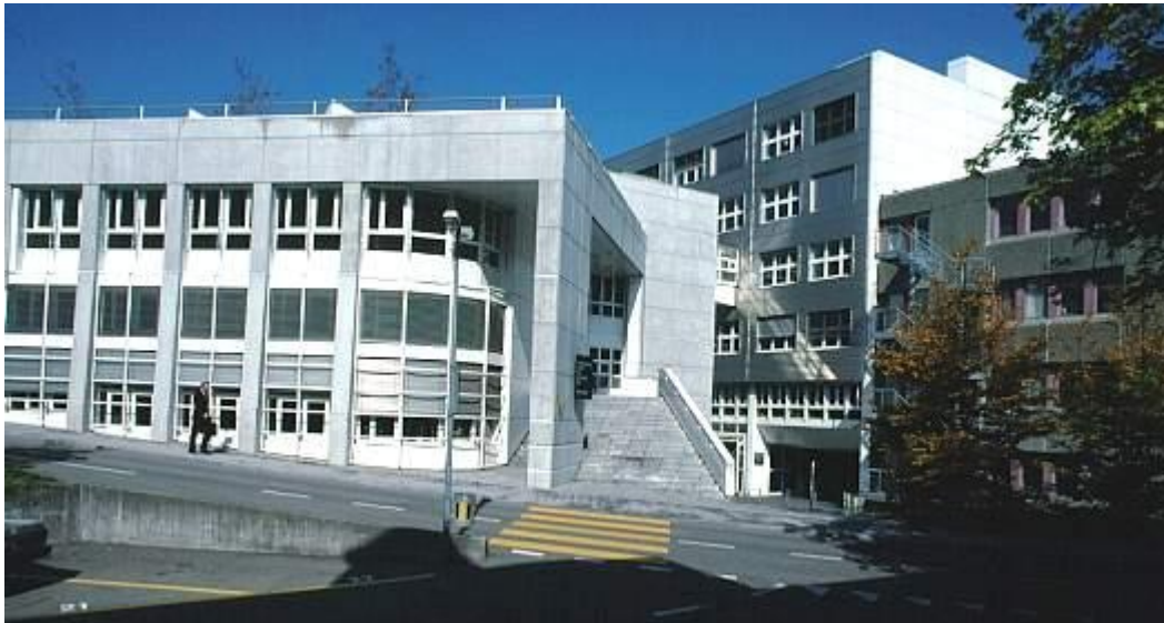
Institute of Pathology at the Medical School University of Bern

The venue took place at the Institute of Human Pathology of the „Inselspital“ which is the University hospital. The spacious lecture hall with 40 double headed microscopes was ideal to host the event.