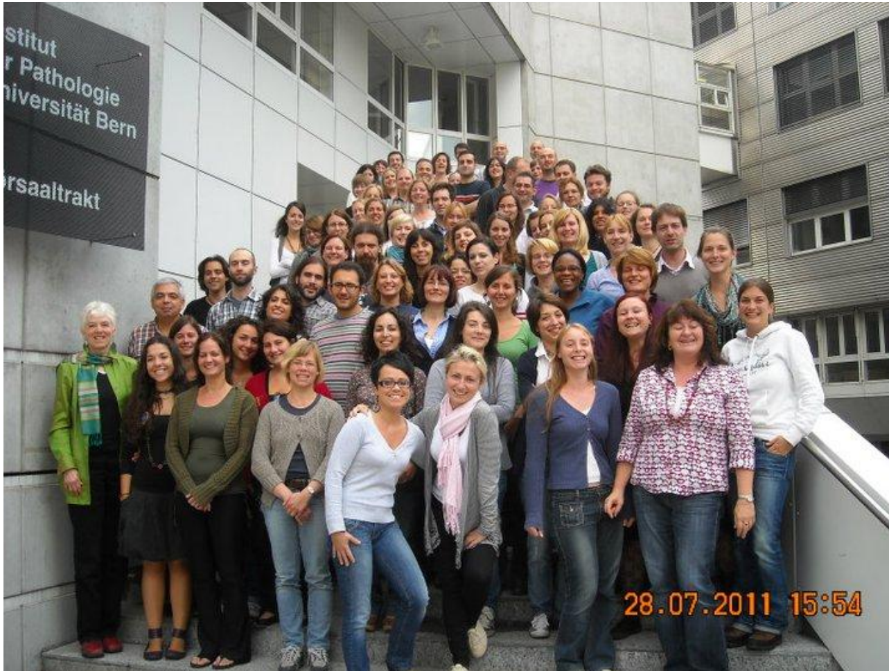
Group photo of the Summer School 2011 participants