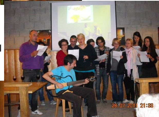
The 2011 Summer School song