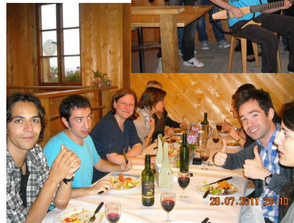
Dinner on top of the Gurten